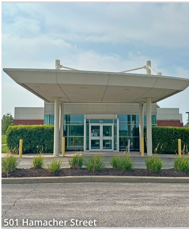
501 Hamacher Street