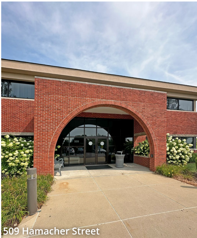
509 Hamacher Street