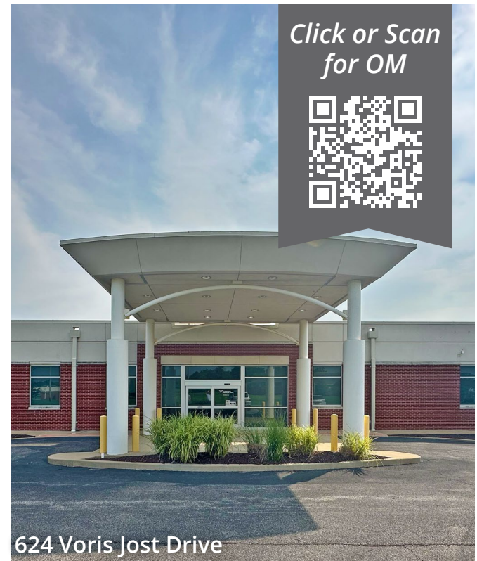
624 Voris Jost Drive